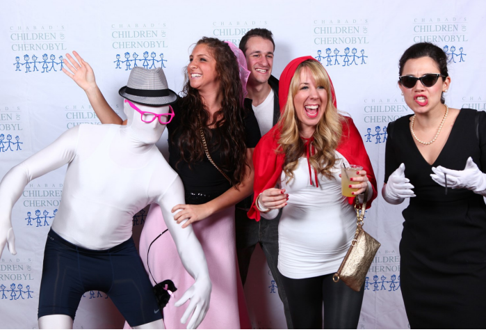
CCOC's New Leadership division hosted the Sixth Annual Purim Benefit Bash on Thursday, February 21st in NYC. 500 young professionals attended (all in costumes) to celebrate for a cause, and as a result, enough funds were raised to rescue two children and provide the necessary living expenses (housing, medical care, food, clothing, etc.) for a year.

One creative new event which the New Leadership Board members conceptualized was a rooftop auction. This sum-