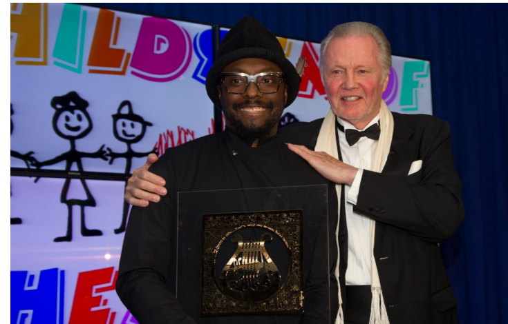
will.i.am accepts his "Song of Hope Award" from Jon Voight.