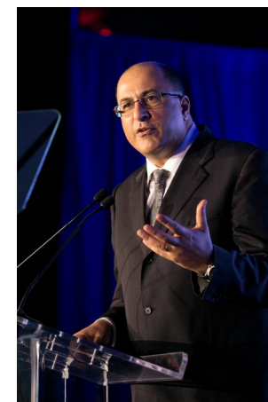
Consul General of Israel, Amb. Ido Aharoni shares remarks.