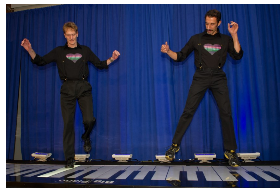
Performers from FAO Schwarz play the autographed BIG Piano that was created especially for CCOC and donated to the auction by its inventor, Remo Saraceni.