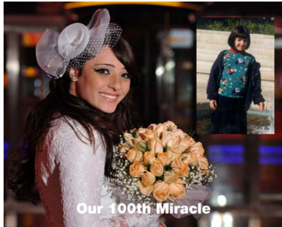
Our 100th Miracle

The 100th flight serves as a reminder of the countless number of children who await rescue from their contaminated surroundings in Chernobyl. It will mark CCOC's accomplishments and the 2,863 children saved